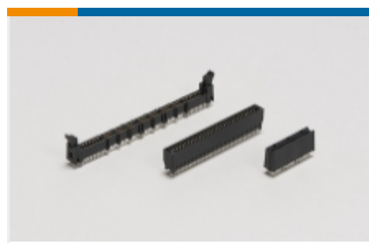
Card Edge Power Connectors(1)