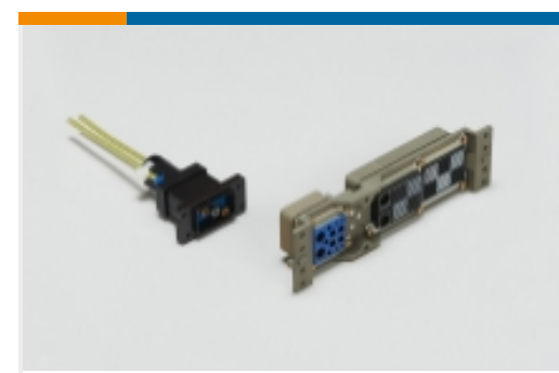
Rack &amp; Panel Connectors(1)