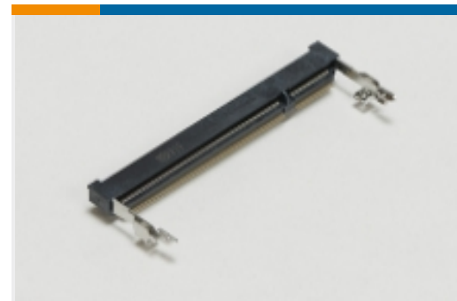
SO DIMM Sockets(12)